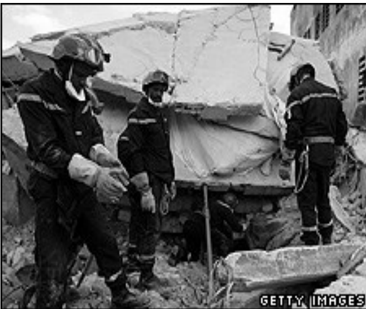
Many rescuers such as these from France are doing their part to help return Haiti back to normal.